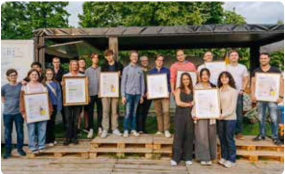
Their startup ideas convinced the expert jury and the audience last year: winners of the HHU Ideas Competition 2023

We are looking for ideas and solutions that you have encountered in your studies, research or everyday life. This means that the idea can still be in its infancy and does not have to be ready for the market.